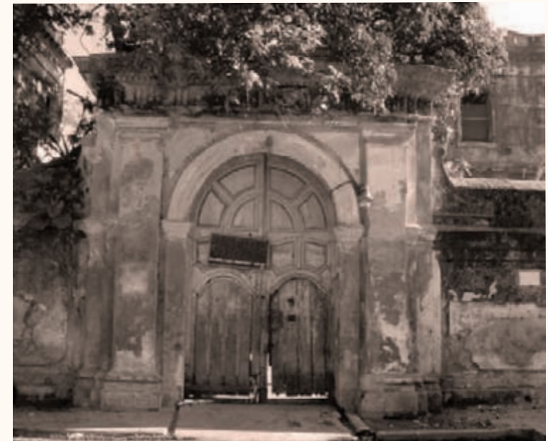
The original gate of Le Dupleix has been lovingly refinished. One of the most famous gates of French Pondichéry, it is often to be seen in paintings and images of French Pondichéry.