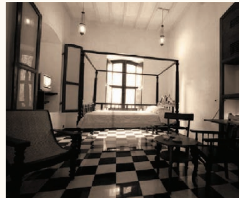
Every room is different, with antique furniture collected over a lifetime.