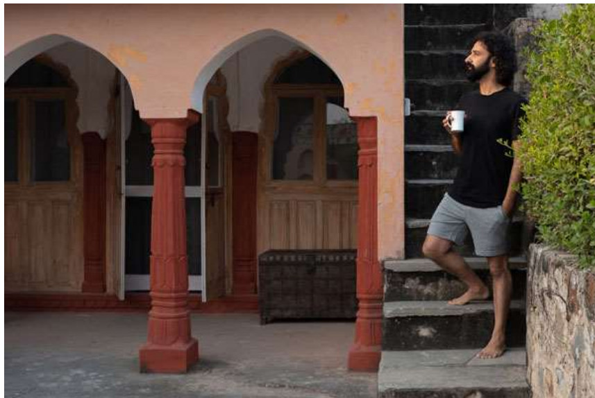
My little home in the fort :)