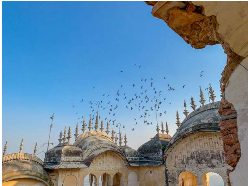
Another shot at Alwar fort