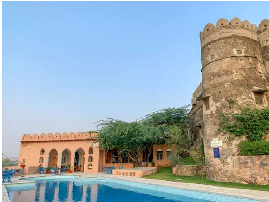
Poolside during the day!