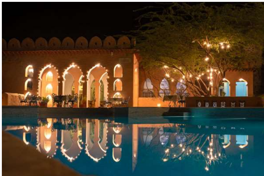
My favorite spot - the swimming pool!