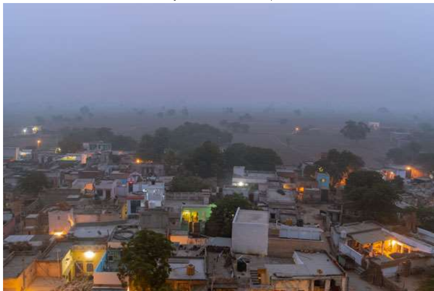
View of the village from my room :)

Over the three days I spend there, I ate and drank to my heart's fulfillment, swam in one of the most beautiful swimming pools that I've ever seen, got a lovely massage in the spa and made some beautiful photos too.