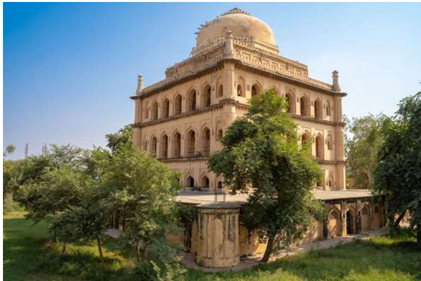
Fateh Jung gumbad

However, my biggest surprise there was the Alwar Quila - located on top of a hill with a fantastic view of the town below. The Qila was built on the foundations of a 10th century mud fort and is a must-visit destination here. The guards there are a little bit difficult and it takes a bit of convincing for them to allow you access to the entire complex. Do whatever it takes because the walk in the fort is delightful.