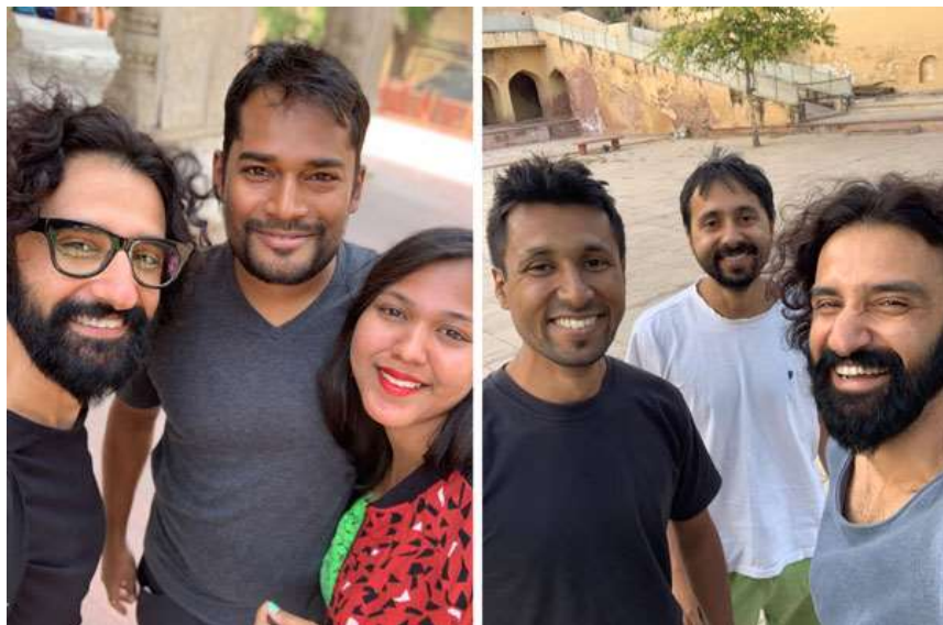
Meeting friends and making new ones too :)

Right next to the Chhatri is also the City Palace and the the Palace Museum . The museum is how most Indian museums are - great collection, but poor information about just about everything. I do wish someday our museum curators create world-class museums here in India - no one quite has the kind of museum-wealth that India has.