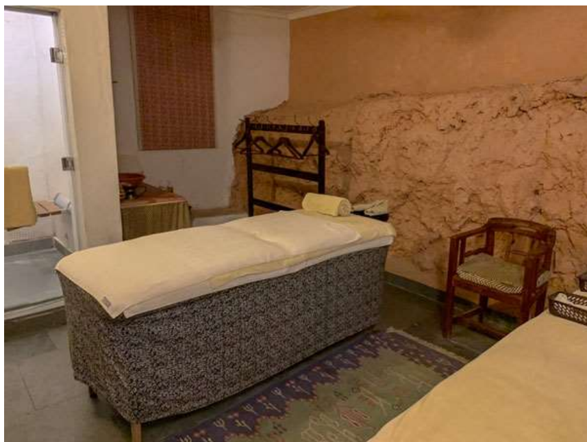
My massage table!