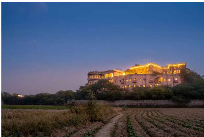
Hill Fort Kesroli

Late last year before Diwali I had a long weekend in Delhi with almost no plans at all. Actually, it's often these unplanned weekends that create the best memories and this one was no different. Not only did I spend my time at one of the oldest heritage hotels in India that one can live in, I also discovered a lesser known gem of Rajasthan - Alwar!