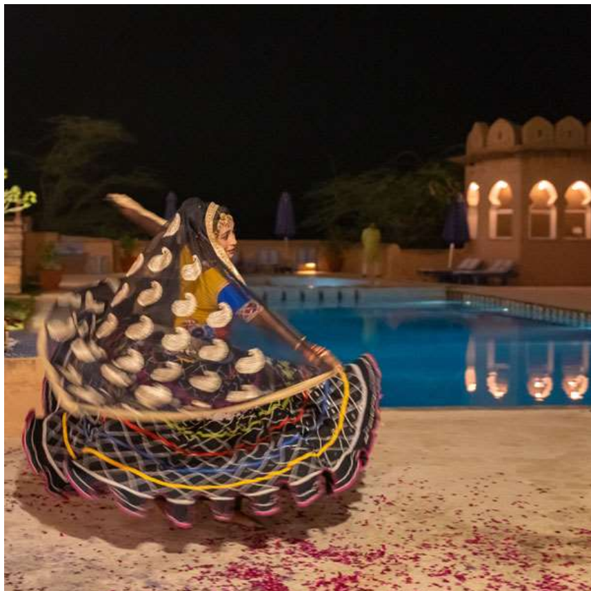
A dance performance in the evening