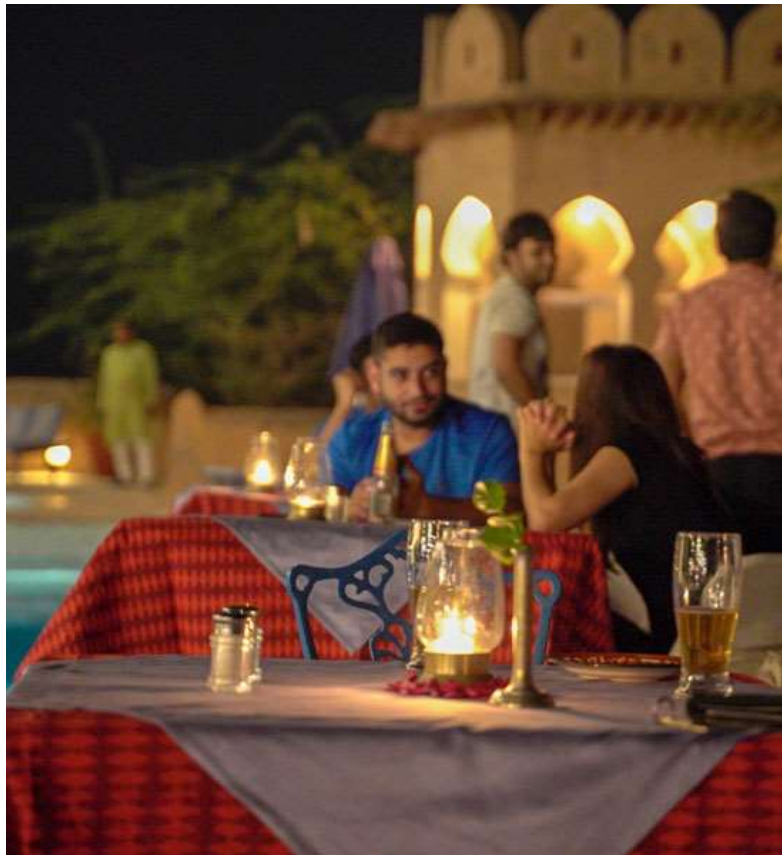
A young couple enjoying their romantic evening!