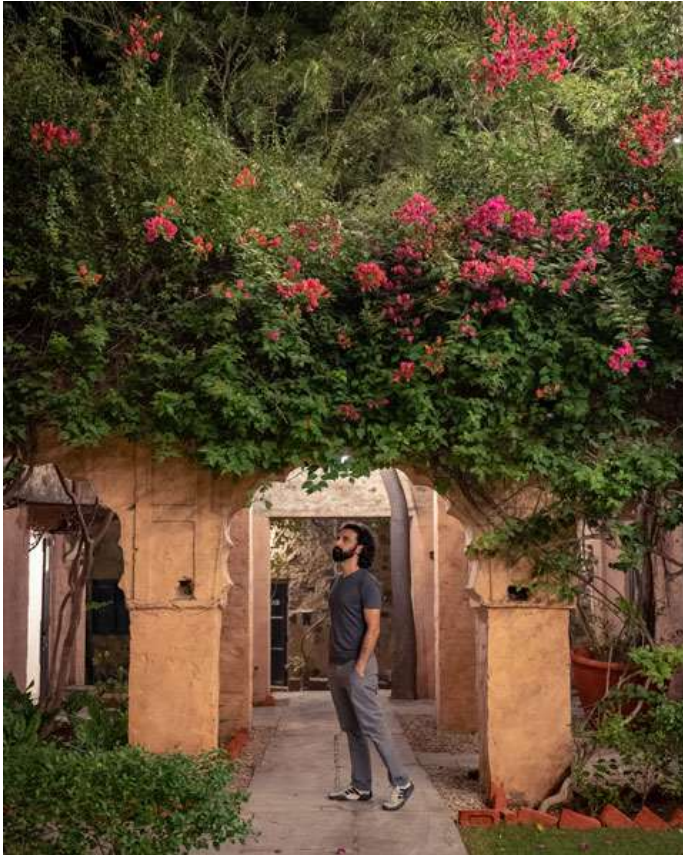
Trying to pose with a camera on a tripod :)

In case you are still wondering what I did, I spent my weekend at Neemrana's Hill Fort Kesroli - a fort whose history can be traced back to seven centuries! For someone like me who's always on a lookout for old and historical places, this was like living a dream.