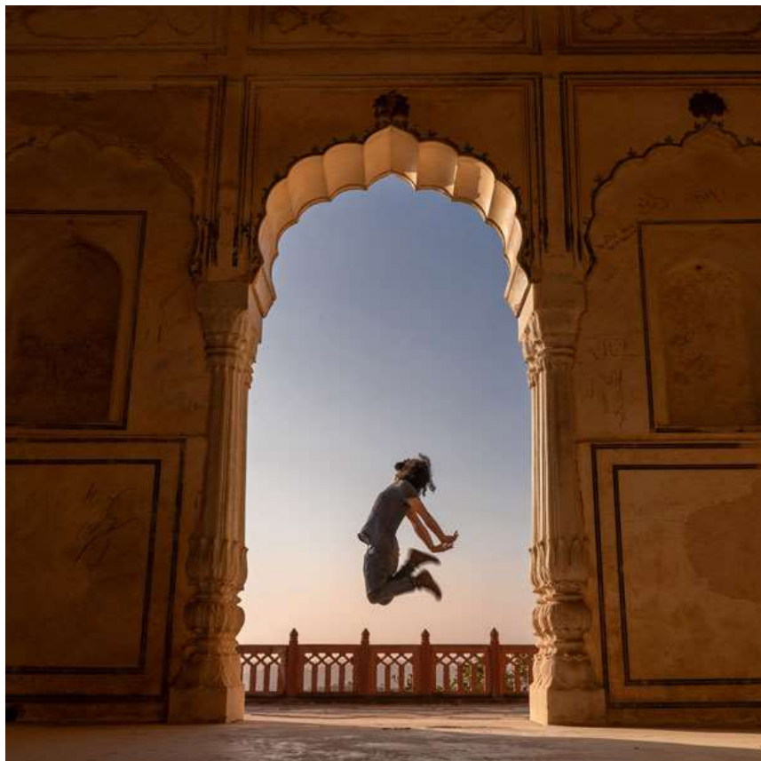
That's me jumping at Alwar fort!