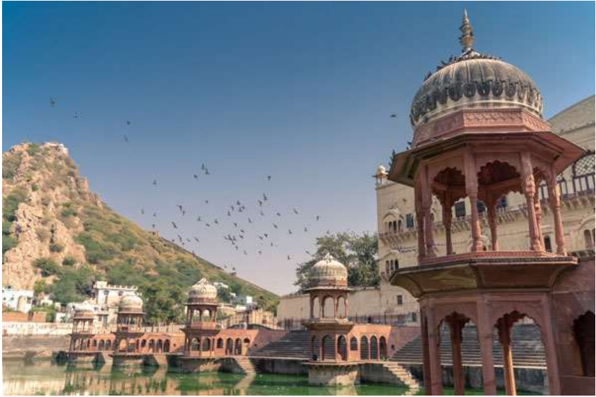
The pond near Moosi Maharani Chhatri

This would come out as an embarrassment, but I knew absolutely nothing about Alwar but it's name. I never even imagined the city to be full of architectural marvels and it's own unique cultural heritage. In that sense, I came back a far more learned man after this trip - Alwar took my heart :)