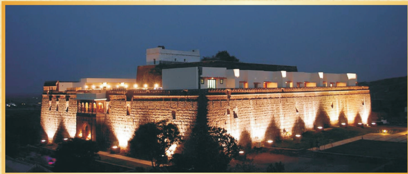
Fort JadhavGadh, now a heritage 5-star hotel, is conveniently located just 22 km from the charming Pune city on the Pune-Saswad Highway.