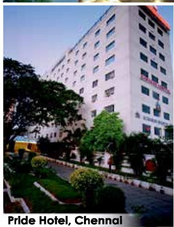
Pride Hotel, Chennai