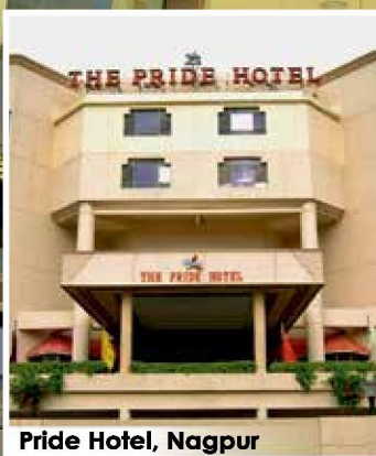
Pride Hotel, Nagpur