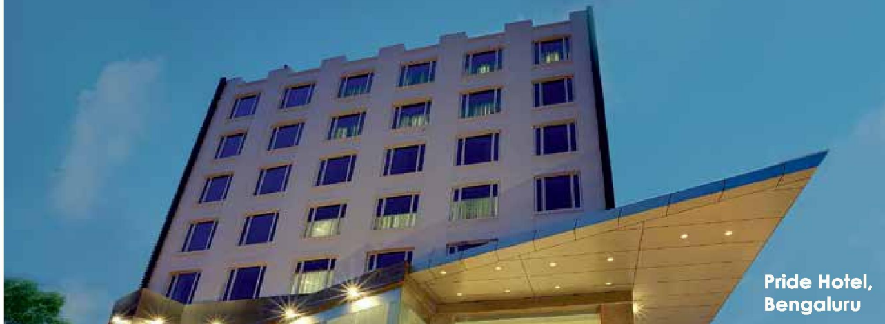
Pride Hotel, Bengaluru