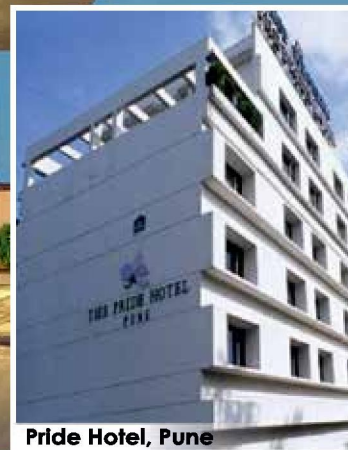
Pride Hotel, Pune