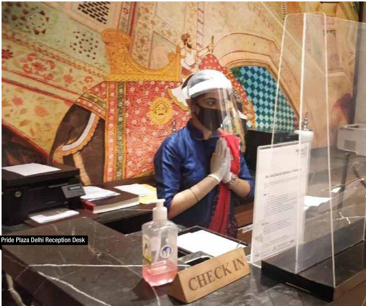
Pride Plaza Delhi Reception Desk

Tourism is also a potentially large employment generator besides being a significant source of foreign exchange for the