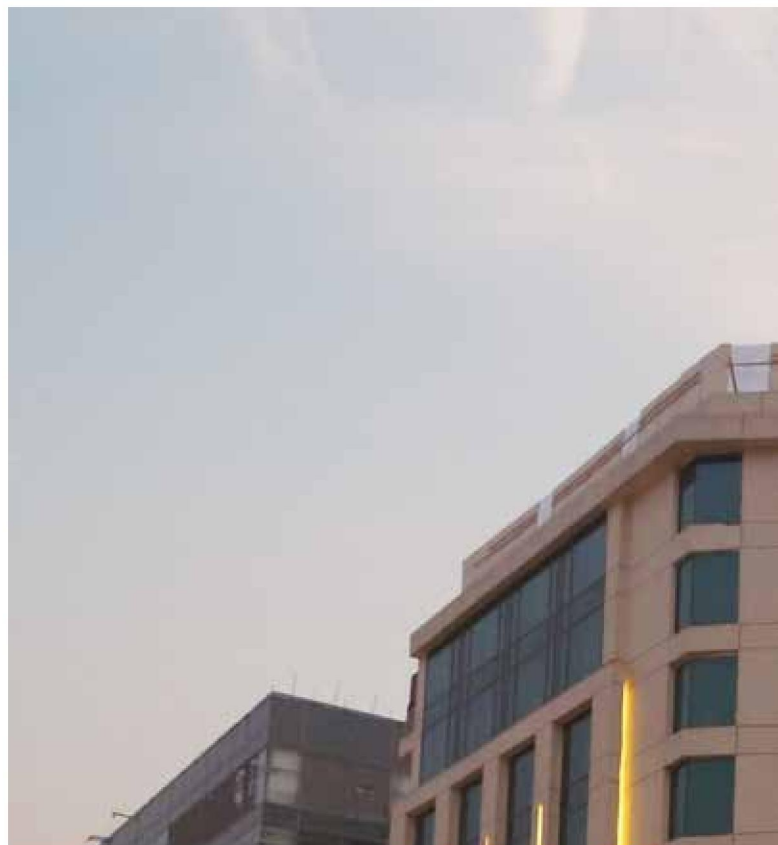
Pride Hotel Bangalore

He said "Further, we have ensured that our teams are trained and up to date with new enhanced cleaning practices and hygiene standards as advised by the government. And we're also strictly following it so that it becomes a way of life for them in this new normal".