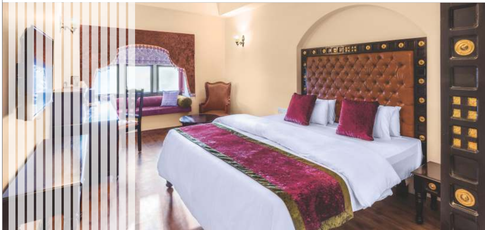
View of the Guest Room at Sairafort Sarovar Portico, Jaisalmer