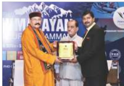
Homitel Roorkee has been awarded as the "Best Budget Hotel of Uttarakhand" and the "Best Super Luxury Hotel (for Water Conservation) on World Tourism Day by PHD Chamber - Himalayan Tourism Samman Uttarakhand