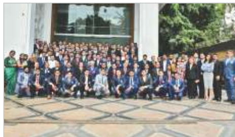
Delegates at the 24th Annual Meet at la Marvella - A Sarovar Premiere Hotel, Bengaluru