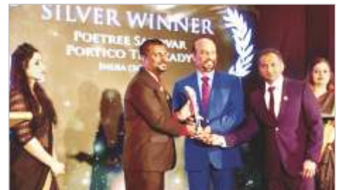
Poetree Sarovar Portico, Thekkady, Kerala has won the prestigious SATA (South Asian Travel Award) Silver Award as the "Leading Wildlife Resort" in South India