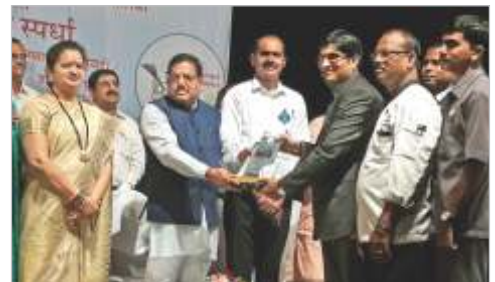
Majestic Court Sarovar Portico, Navi Mumbai bagged the "Cleanest Hotel of Navi Mumbai Award" from the Commissioner & Mayor of Navi Mumbai