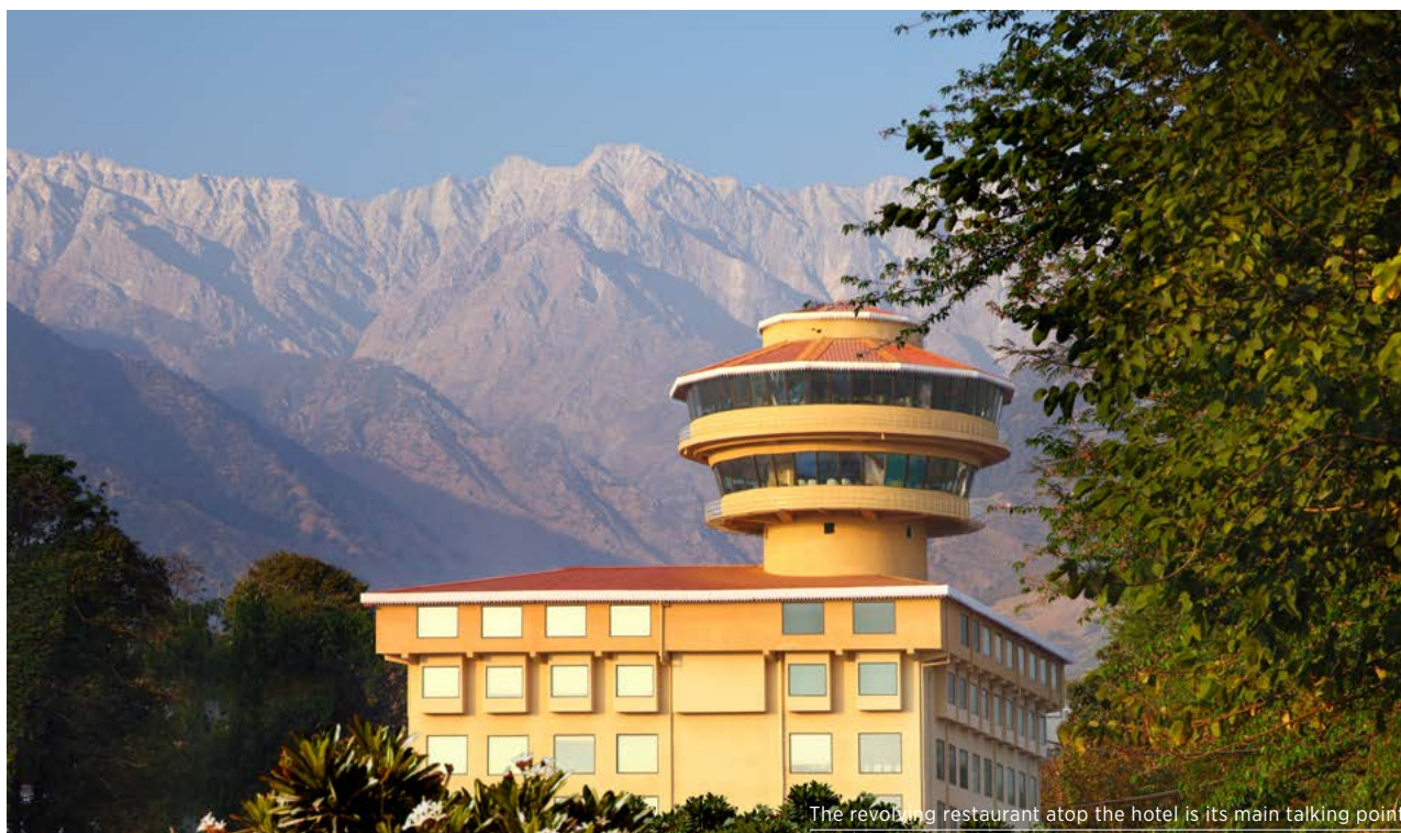
The revolving restaurant atop the hotel is its main talking point